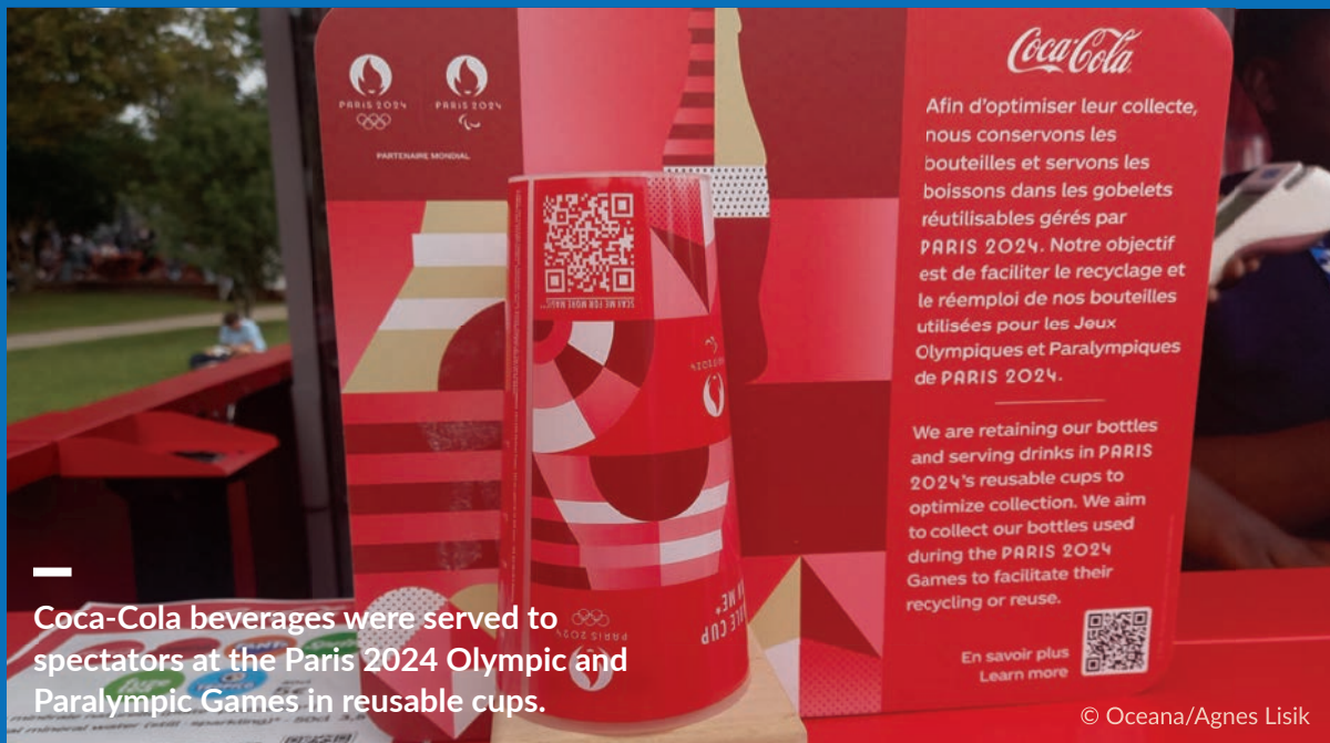
Coca-Cola beverages were served to spectators at the Paris 2024 Olympic and Paralympic Games in reusable cups.

In 2024, the Paris Olympic and Paralympic Games became the largest sporting event in history to serve beverages to spectators in reusable cups. The system was flawed, as some beverages were poured into reusable cups from single-use plastic bottles, and reusable cups were branded with the Olympic logo making them attractive to fans to take home as souvenirs and unable to be used at future events. 97 Despite this, the Paris 2024 Organizing Committee reported that the Games achieved a 52% reduction in single-use plastic compared to the London 2012 Games and a 70% reduction in the number of single-use plastic bottles used. 98 The report cited a “new drinks distribution model” including the use of drink fountains with reusable cups and returnable glass bottles, as well as promoting the use of personal water bottles, and reducing single-use plastic packaging as the key actions that were taken to achieve these outcomes. 99 Paris 2024 proved that reusable packaging used at scale can dramatically reduce single-use plastic packaging waste. Coca-Cola should commit to using reusable packaging at the upcoming Winter and Summer Olympic games in Italy and Los Angeles, respectively, as well as at the 2026 FIFA World Cup. Coca-Cola is a major sponsor of all these events.